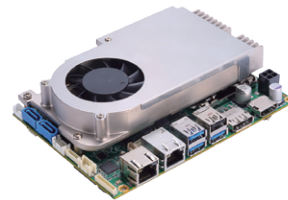
▲ Assembly View